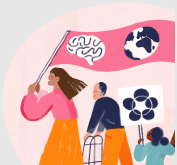
Image description: An official image for Global MS Awareness Day shows 3 people and a child marking the day.